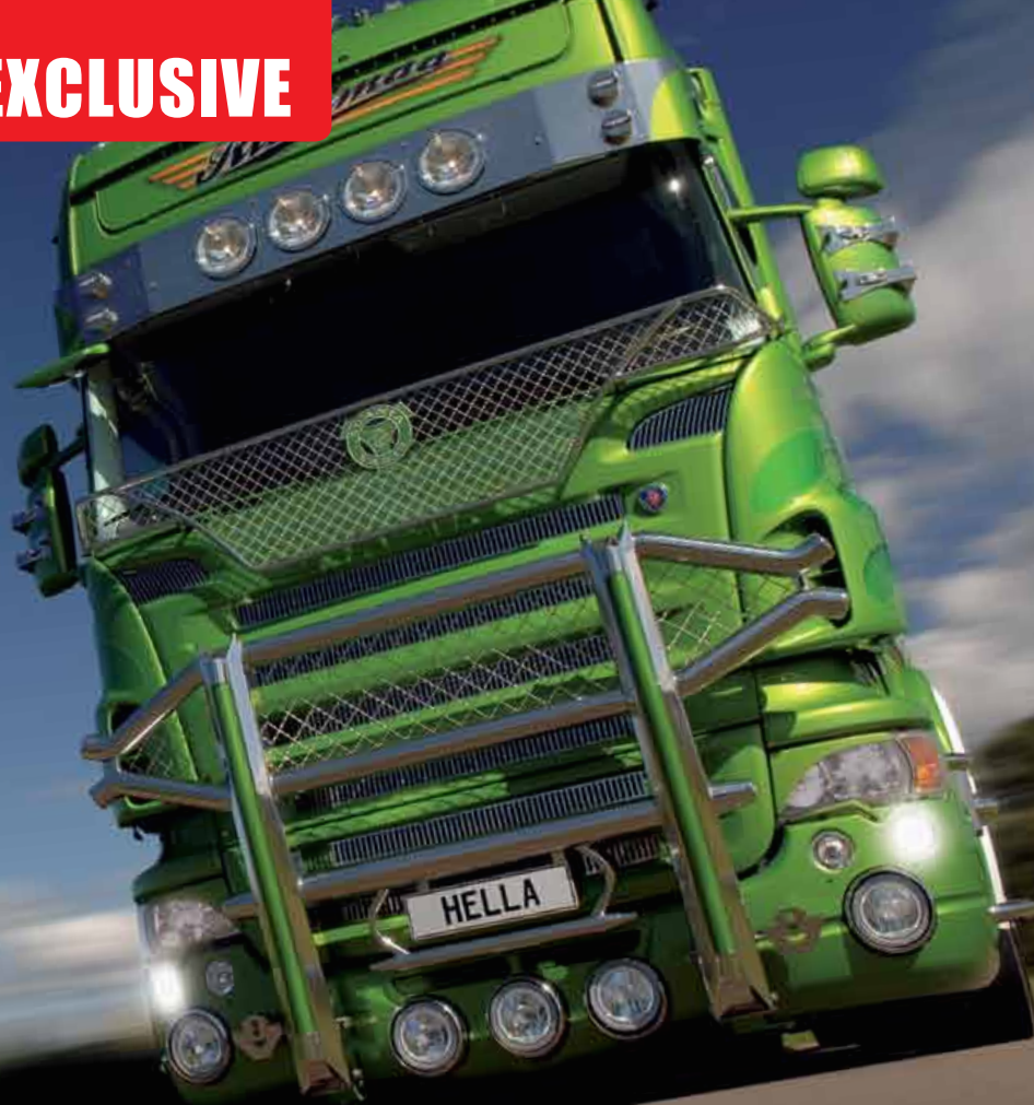
Overseas vehicle shown