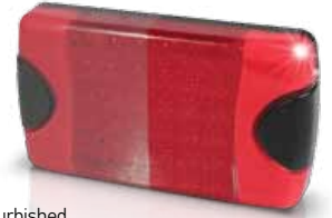
Example of a refurbished DuraLed® lamp.

HELLA LED interior and exterior lighting ranges significantly reduce energy consumption in a myriad of Marine, Domestic and Automotive applications, compared to filament based lighting.