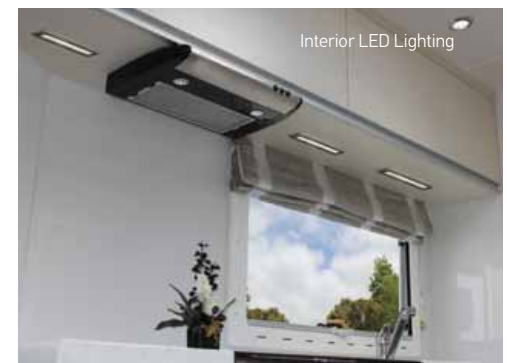
Interior LED Lighting