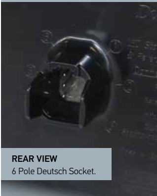
REAR VIEW 6 Pole Deutsch Socket.

This new feature allows easy fitment of the lamp to vehicles or quick replacement if the lamp is damaged, reducing down time. It also allows for fault diagnostics, as the connector can be tested independently of the lamp, instead of having to cut into sealed wiring looms. The new lamp is especially suited to production line manufacturing of trailers or motor bodies, as the wiring loom can be terminated with the DT plugs, and allows quick and easy connection of the lamp.