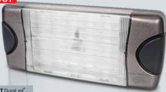
P/N 2380-DT DuraLed® Combination Lamp with DT Connector.