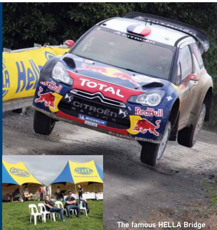
The famous HELLA Bridge