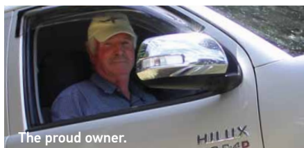
The proud owner.

The farm extends further above the house to 3000 ft to partially border the Urewera National Park. Tahora is a sheep and beef property running 500 stock units, covers 800 hectares and is a stunning example of high country New Zealand that receives the best and the worst of the areas rapidly changing weather.