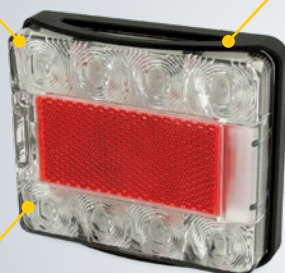
Stop / Rear Position / Indicator Lamp