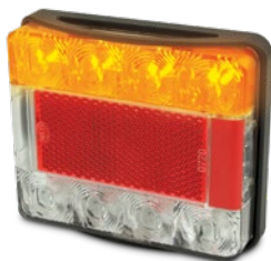
Rear Direction Indicator Function