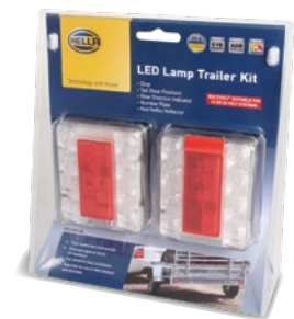
LED Combination Lamp Trailer Kit (includes 8 x heat sealed connectors)