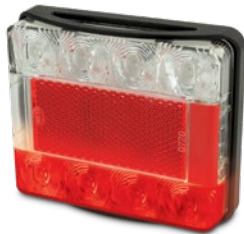
Stop Light Function