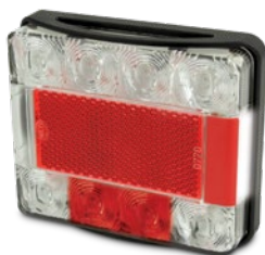
Rear Position / Number Plate Function